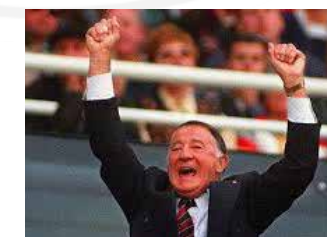
Celebrating a Manly Grand Final try