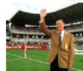
Being honoured at Brookvale