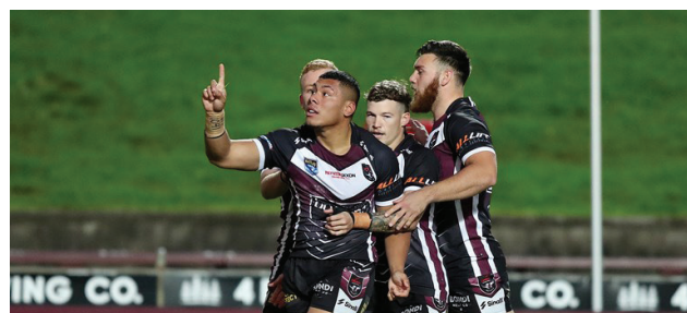
MANLY-WARRINGAH RUGBY LEAGUE FOOTBALL CLUB LIMITED ANNUAL REPORT 2022