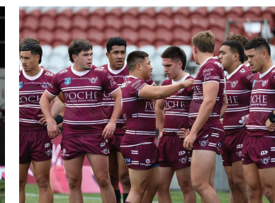
MANLY-WARRINGAH RUGBY LEAGUE FOOTBALL CLUB LIMITED ANNUAL REPORT 2022