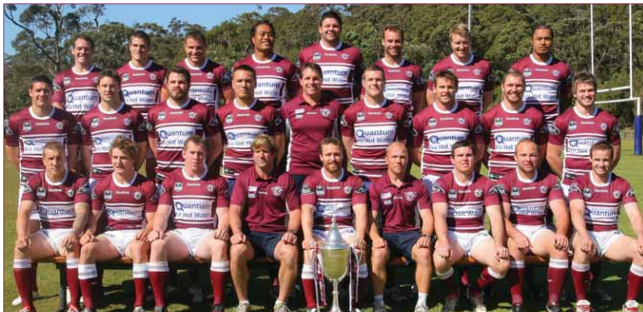
BACK ROW: HEATH L'ESTRANGE, MATT BALLIN, ANTHONY WATMOUGH, ANDREW SUNIULA, GEORGE ROSE, BRETT STEWART, SHANE RODNEY, STEVE MATAI MIDDLE ROW: SHANE NEUMANN, CHRIS BAILEY, ADAM CUTHBERTSON, JARED WAEREA-HARGREAVES, KELLY EGAN (ASST. COACH), JASON KING, JOSH PERRY, PHIL MORWOOD, DAVID WILLIAMS FRONT ROW: TRENT HODKINSON, KIERAN FORAN, GLENN HALL, DES HASLER (COACH), MATT ORFORD (CAPTAIN), GEOFF TOOVEY (ASST. COACH), JAMIE LYON, GLENN STEWART, MICHAEL ROBERTSON