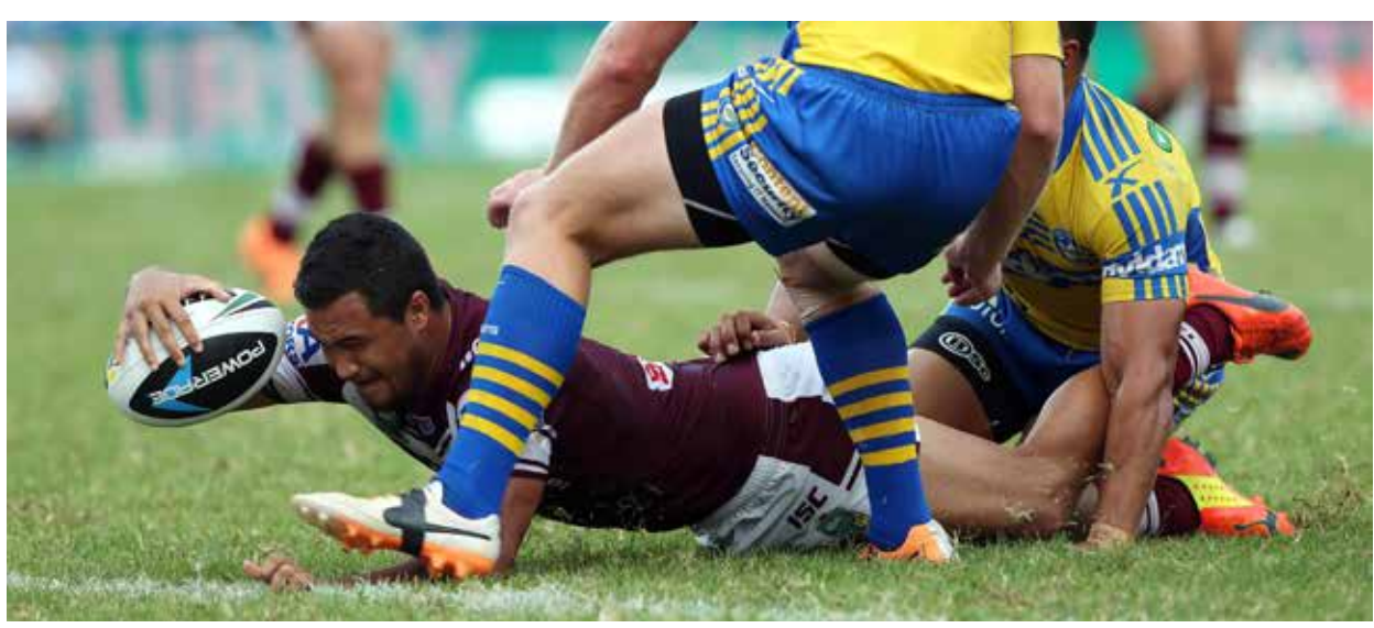
MANLY-WARRINGAH RUGBY LEAGUE FOOTBALL CLUB LIMITED ANNUAL REPORT 2014