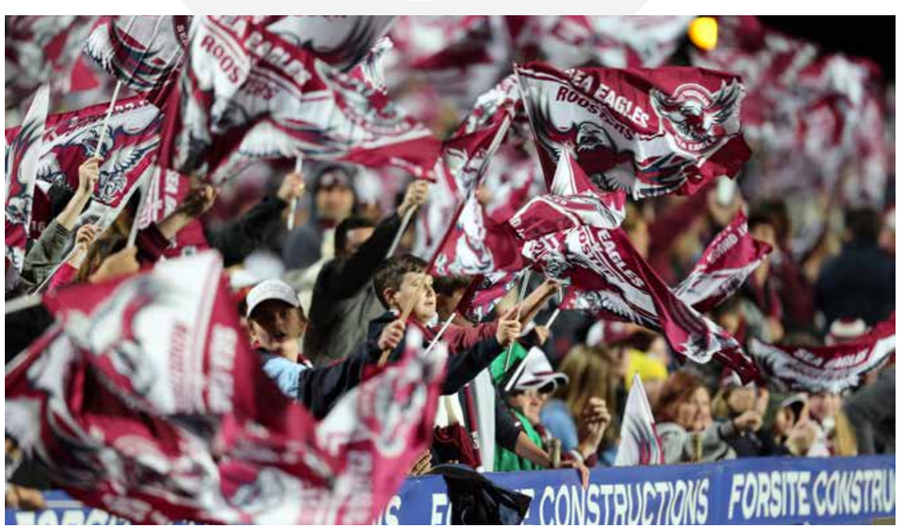
MANLY-WARRINGAH RUGBY LEAGUE FOOTBALL CLUB LIMITED ANNUAL REPORT 2014