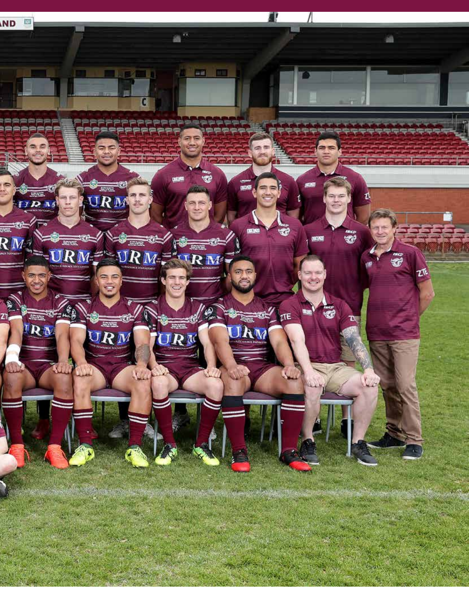
MANLY-WARRINGAH RUGBY LEAGUE FOOTBALL CLUB LIMITED ANNUAL REPORT 2017