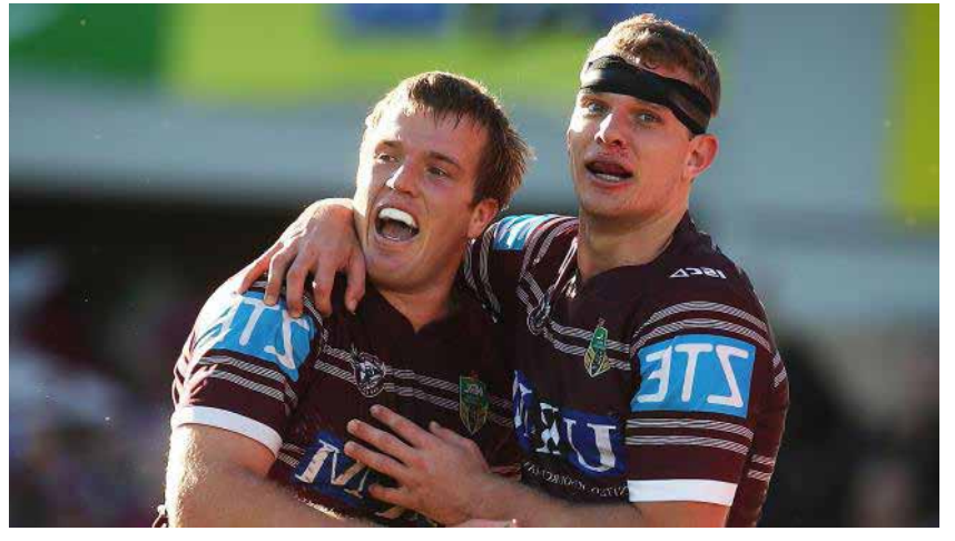
MANLY-WARRINGAH RUGBY LEAGUE FOOTBALL CLUB LIMITED ANNUAL REPORT 2017