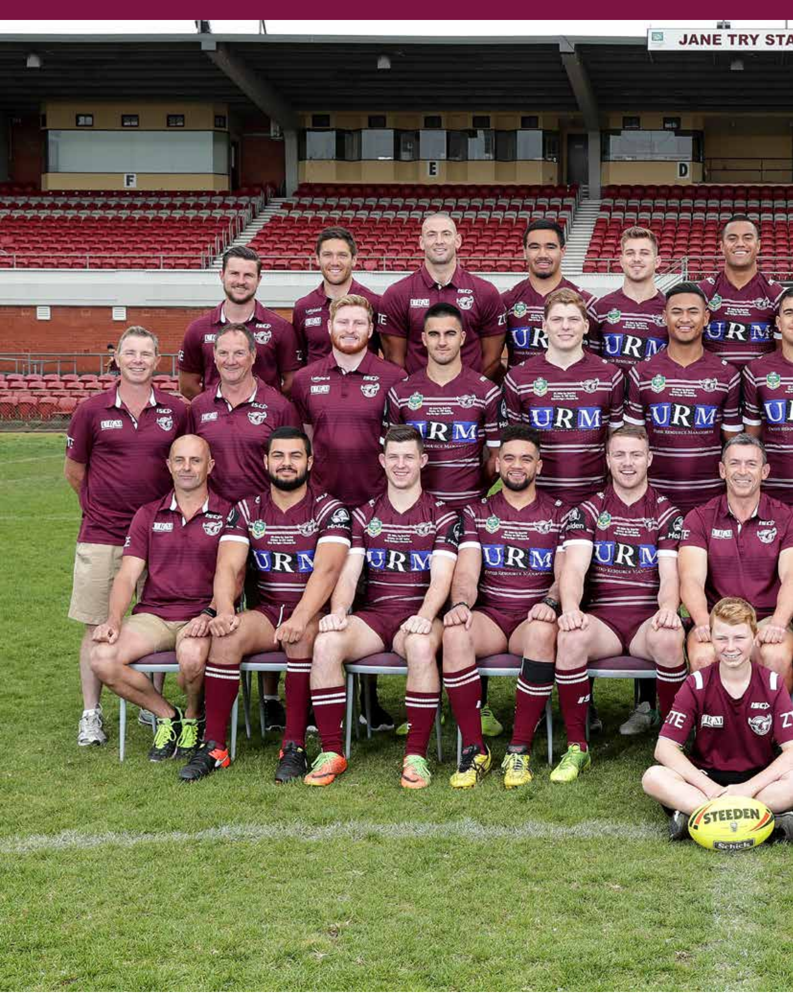
MANLY-WARRINGAH RUGBY LEAGUE FOOTBALL CLUB LIMITED ANNUAL REPORT 2017